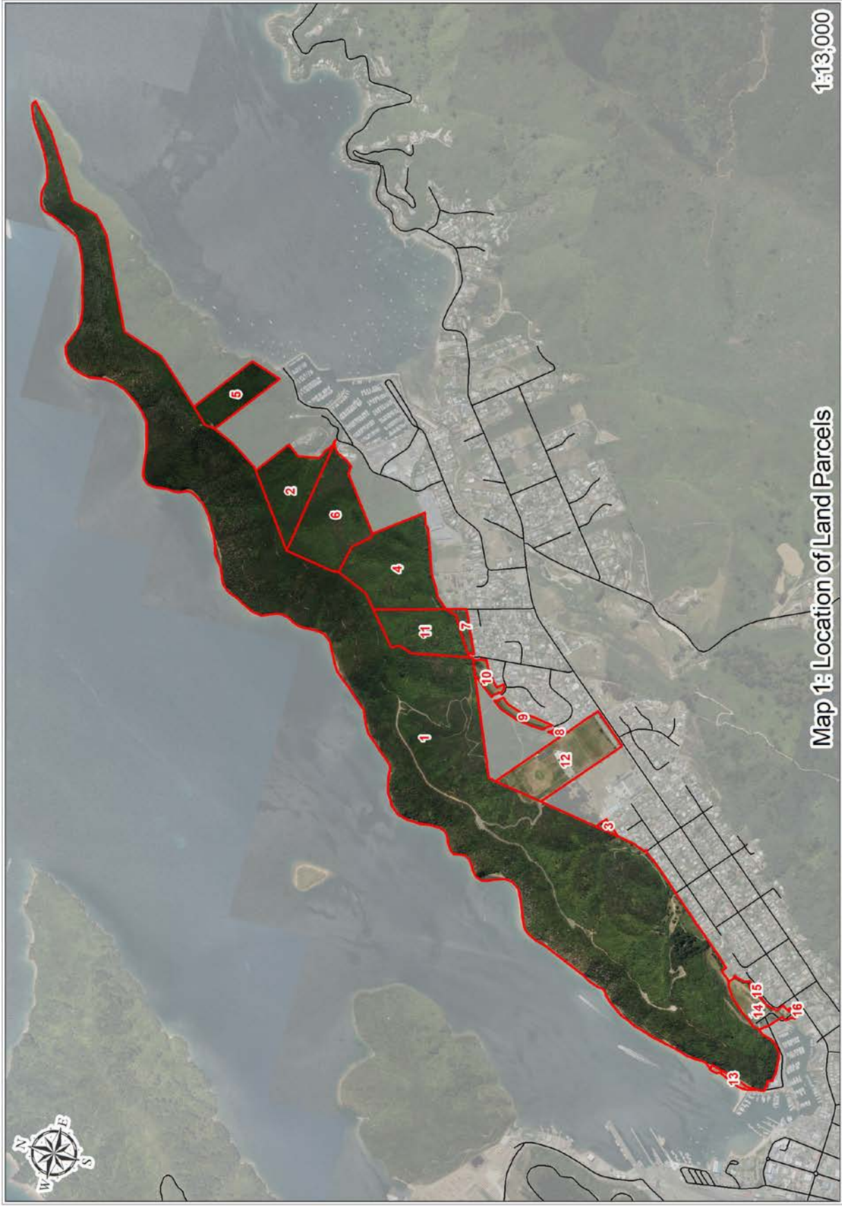
Map 1: Location of Land Parcels